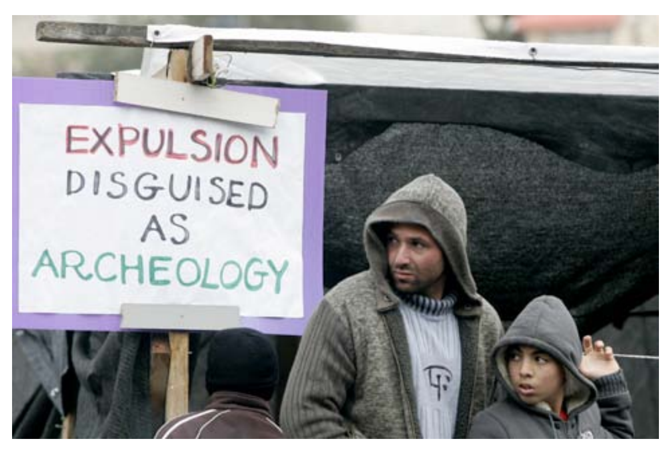
Fig. 2: Protesters at a site of archaeological excavations in Silwan

Israeli nationalist desires, which play out in the ways in which archaeology is conducted in the region, cannot be dissociated from Israel's role as occupier of Palestine. The building of a national territory and practices of colonization are co-constituting parts of a common project of "colonial nationhood" (Abu el-Haj, 2001: 6) within a transnational political framework. The state of Israel actively participates in the global political economy through the management of its nation's cultural heritage: not only does the Israeli government not prohibit or sanction trade in antiquities (Yahya, 2008: 500), but it also furthers "the reification of the archaeological past" (Baram and Rowan, 2004: 7) as a specifically 'Israeli past' through its commodification in the tourism industry. At the same time, Israel's biblical history is no longer exclusively owned by the Israeli nation-state, but it has become a universal good to be consumed by a global tourist community, which, no doubt, is overwhelmingly wealthy (e.g. Baram and Rowan, 2004; Scham, 2008).